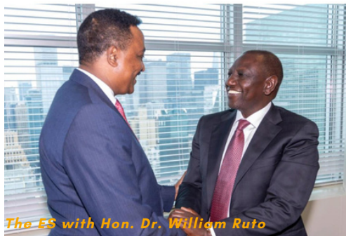
The ES with Hon. Dr. William Ruto