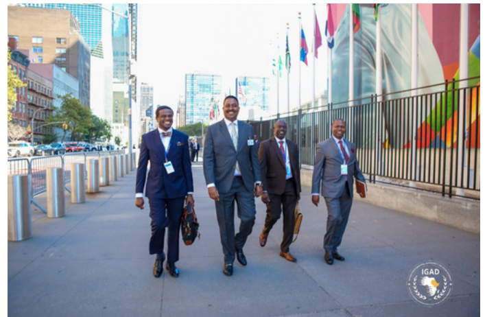
The ES accompanied by a section of the IGAD delegation