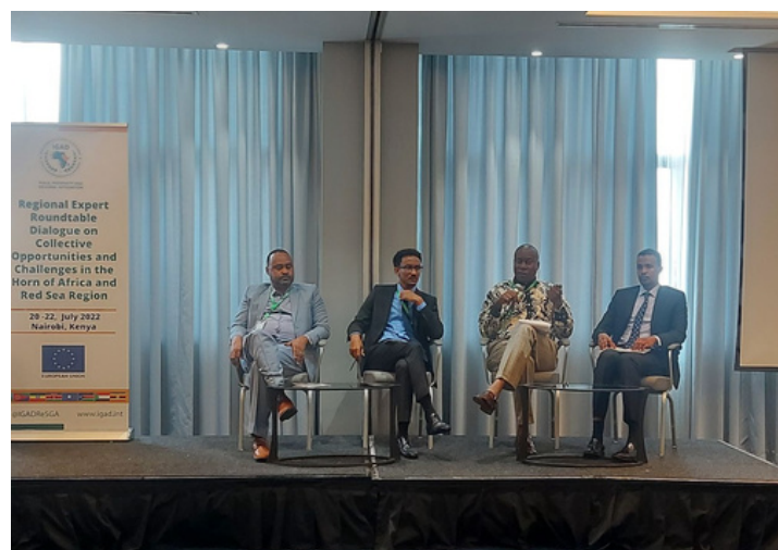
An Expert Panel Discussion at the RESGAS meeting