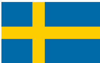
Government of Sweden