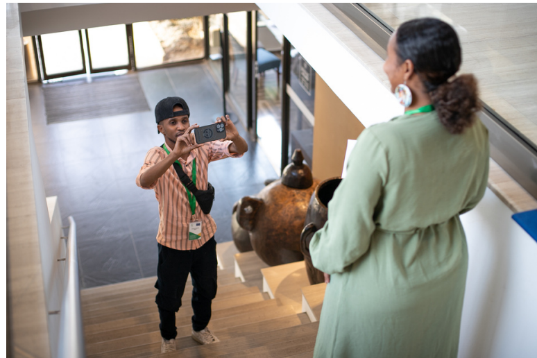
Participants developing the counter/alternative video messages

To nullify violent extremist ideologies and narratives, the meta-narratives must be well understood. The violent extremists narratives are based on meta-narratives which are carefully organized and compelling religious texts twisted to effectively achieve their aim of radicalizing. It is against this backdrop that the Centre organized a strategic communications workshop to enhance capacity of religious leaders, youth and influencers to develop and disseminate counter and alternative narratives to undermine the violent extremists' ideologies. Seven counter and alternative messages were developed.