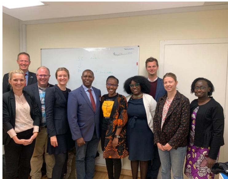
The Government of Denmark Officials and Centre staff

Assessing the journey towards preventing and countering violent extremism in the region is critical towards measuring progress and impact. One of our key partner enabling the implementation of P/CVE initiatives in the Horn of Africa is the Government of Denmark under the Peace and Stabilization Programme. On 31st August, 2022 the Centre team led by the Director held discussions with Government of Denmark officials on the implementation of the specified programmes targeting state and non-state actors to prevent and counter the threat of violent extremism. Out of the discussions it emerged necessary that efforts towards peace and stability in the Horn of Africa needs to be prioritized.