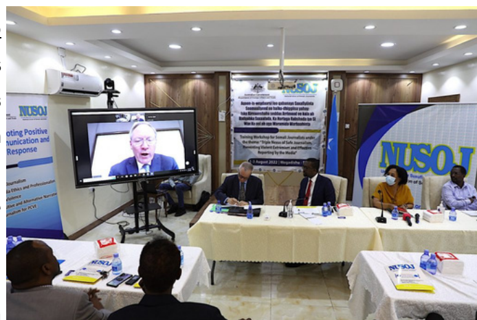
The NUSOJ workshop ongoing