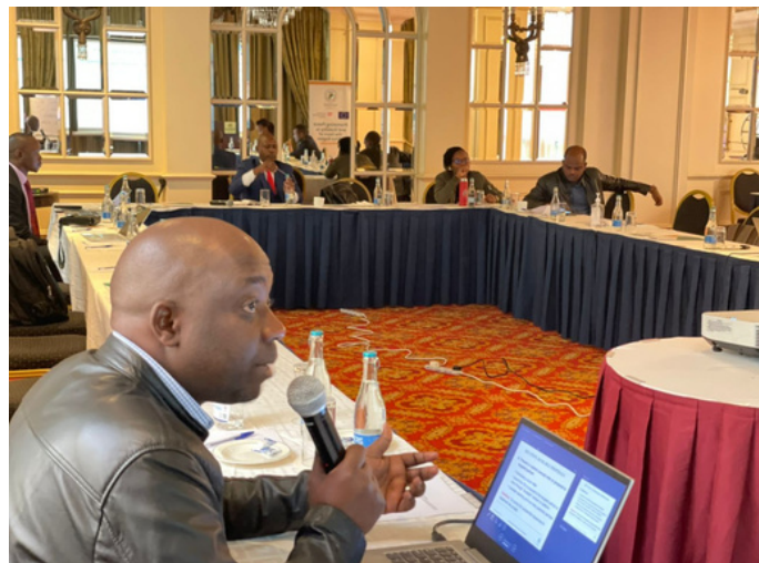
A section of Centre staff during the workshop

The strength and sustainability of an institution is as good as its employees. Capacity building for employees is a critical exercise that contributes to an organisations effectiveness. It is in this spirit that the Centre's 5 year strategic plan recommends deliberate enhancement of the capacity of staff to mobilize resources to enable continued P/CVE efforts in the IGAD region and beyond. This year the Centre organised a Capacity Building Workshop for its staff on 14-16 September, 2022 in Nairobi. This workshop contributed towards strengthening the capacity of the staff to adopt results based reporting, engage in varied resource mobilization activities and get familiar with the new EU Development Funding Framework.