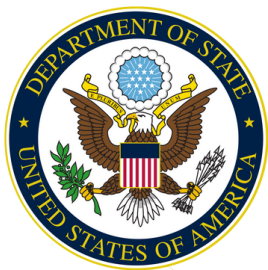
United States Department of State