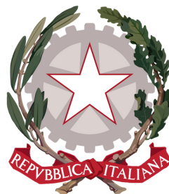
Government of Italy